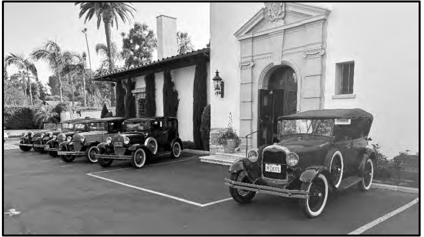
Cocktails on the Terrace. Dinner in the Ballroom. Vintage Entertainment by the Sugar Sisters.