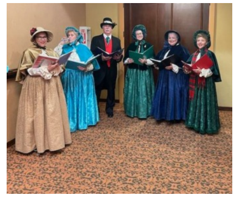
Dickens Holiday Carolers