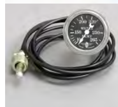
Mechanical Water Temperature gauge