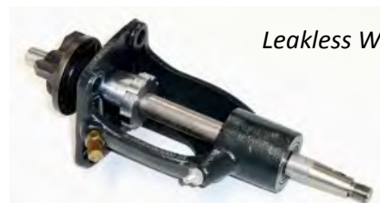
Leakless Water Pump

During hot weather when driving at highway speeds or ascending a hill and the engine temperature of your Model A climbs above 190 degrees and into the danger zone, you need to take action to prevent overheating. First, you should ease up on the throttle a little. Usually this is enough to bring the engine temperature under control. Other things you may find will help is to richen the fuel mixture by turning the choke rod 1/4 turn counter clockwise. A slightly richer mixture will help lower coolant temperature. When the engine is working hard, retarding the spark just a little can be beneficial. Slightly less spark advance can help prevent detonation and also can reduce engine temperature a few degrees. But use caution, retarding the spark too much will reduce power and can overheat the exhaust manifold and the rest of the exhaust system.