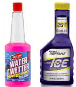
Chemical Additives for your Radiator Coolant