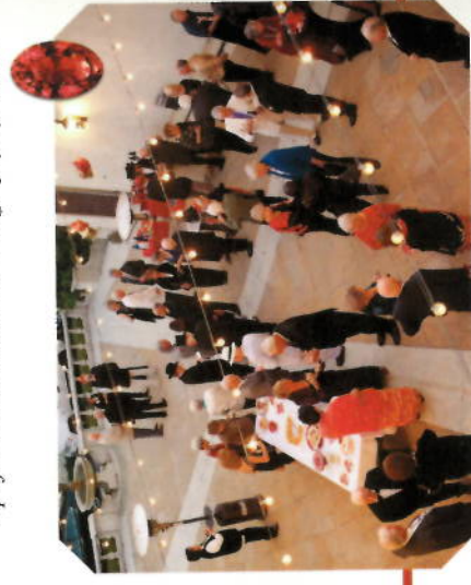
Our well-dressed Santa Anita members enjoying themselves at the Ruby Gala.