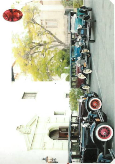
Our Santa Anita A's Model A's added to the elegance of the Shakespeare Club in Pasadena, California.