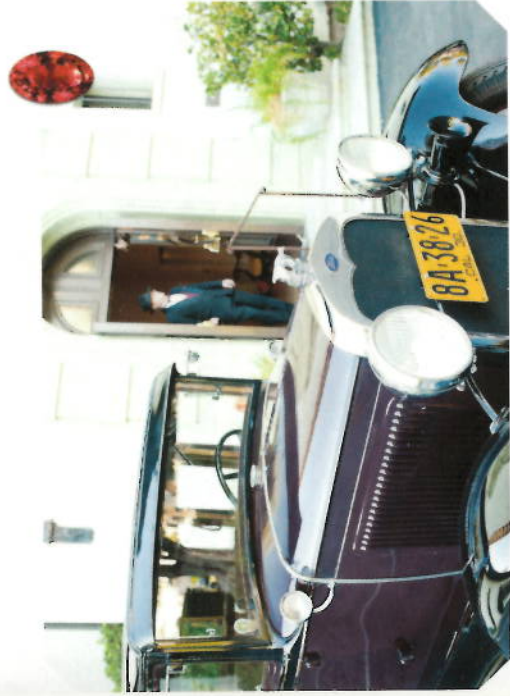
A warm welcome greeted arrivals.