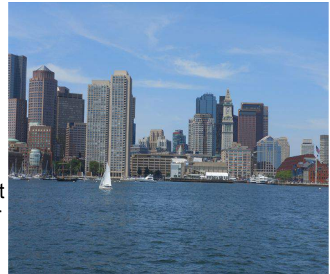
Boston skyline ▲