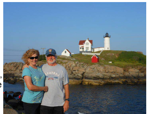
Us in Maine

vanity plates the past couple of months; AND we got to walk behind Niagara Falls.