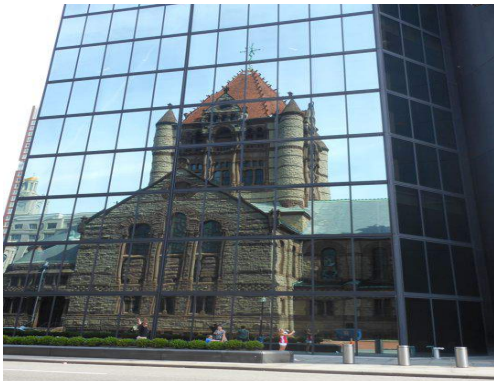
◀ Trinity Church, Boston reflected in John Hancock building