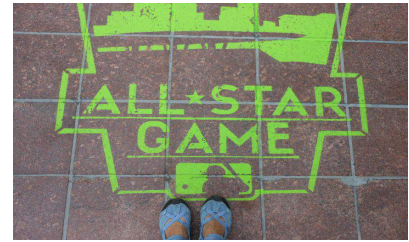
My feet in Minneapolis ▲

Even though my dear husband does not want to travel to faraway places, we did go to the following places on this trip: Wales, Essex, York, Scotland, London, Amsterdam, St Croix, Warsaw, Peru, Marseilles and Manhattan. Jealous yet? Ok, as you probably figured out already, these are all cities in the U.S. that we drove through or near. And the town of Manhattan was in Montana.