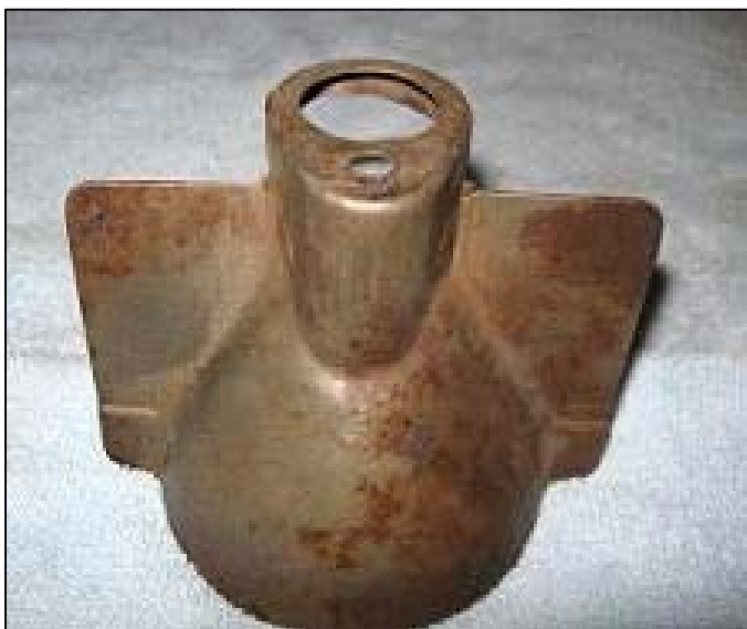
The shield that fits around the oil pump

Common wisdom has it that if you are going to use the oil pump shield you must use the corresponding modified dipper tray.