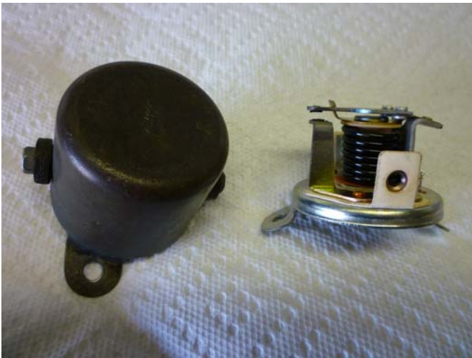
Original quality Ford cut-out on the left. Insides of a poor quality reproduction on the right

The Model A Ford generator cut-out is the mysterious little device that sits on top of the generator. There is a switch inside that is either open or closed. Its very simple purpose is to connect and disconnect the generator from the battery and the rest of the electrical circuit. In the days before there were generator regulator circuits the cut-out was a means to connect the generator to the car's electrical circuit when the engine was running, and disconnect it when the engine was not running.