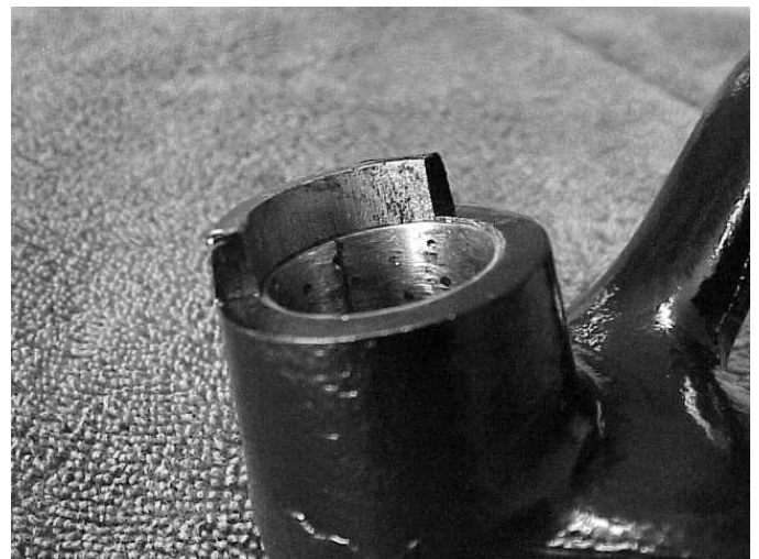
Brake pedal stops