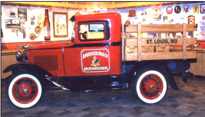
Model A delivery truck at St Louis Brewery - This Bud's for you

Because we are invited to participate as a Model A club, your admission ticket to the event will be your arriving in a Model A. No modern cars, please.