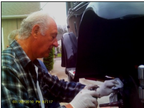
This car receives "White Glove" treatment