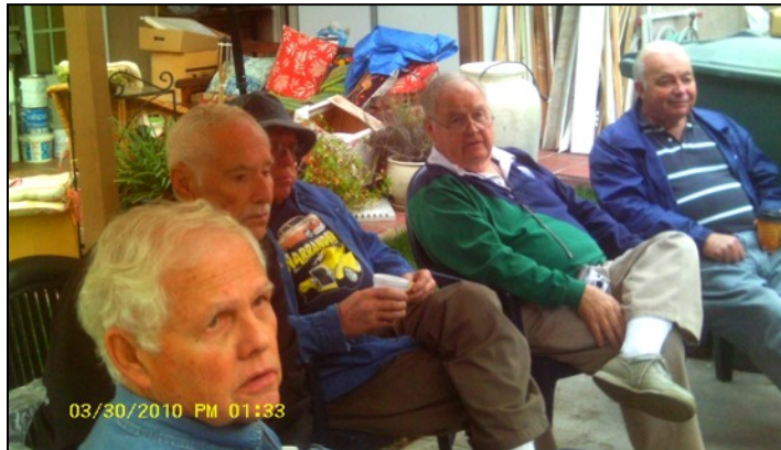
This is how you learn things at a "hands-on" seminar