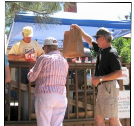
"Yes Sir, Yes Sir, one bag full"