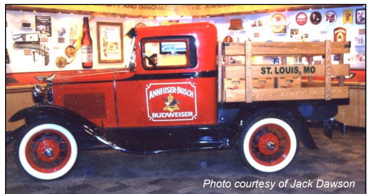
Model A delivery truck at St Louis Brewery - This Bud's for you

Don't miss this one, it's a rare opportunity